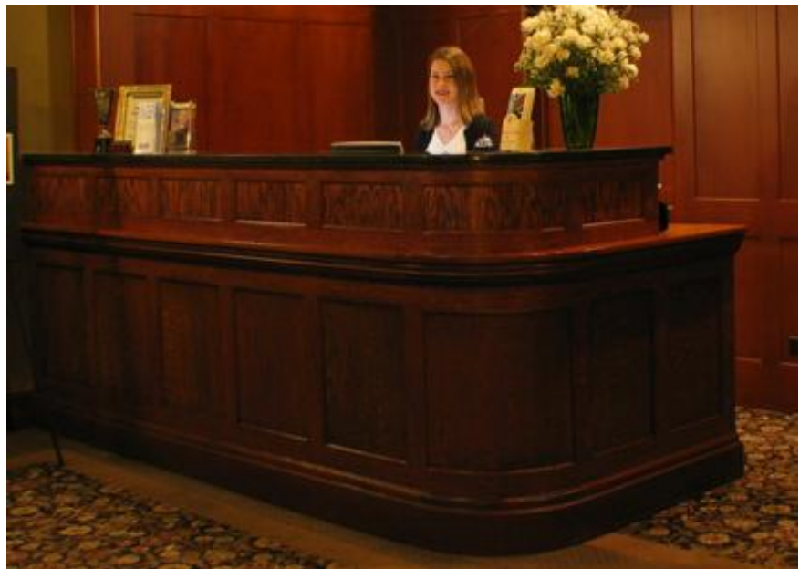
Front Desk style