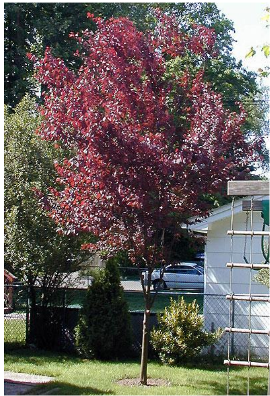
Purple Leaf Plum Tree