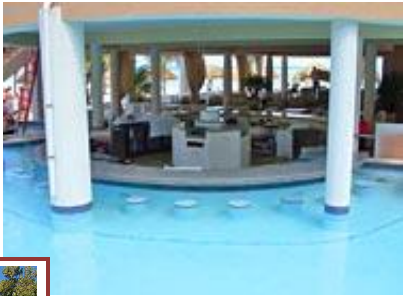
Swim up pool bar