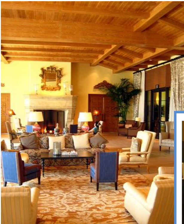
Ceiling and Seating