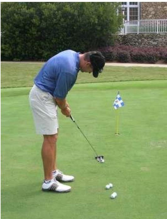
Practice Putting Green