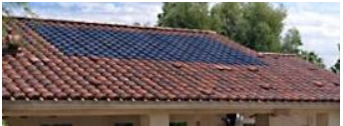
Roof Tiles with Custom Solar Tiles