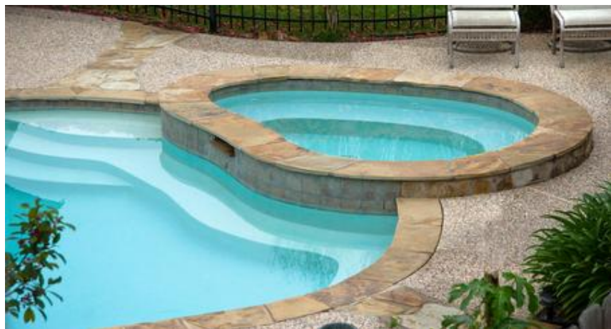
Pool and Jacuzzi