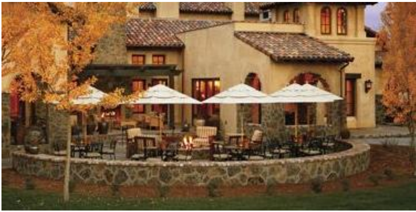
Restaurant and Breakfast Area Patio