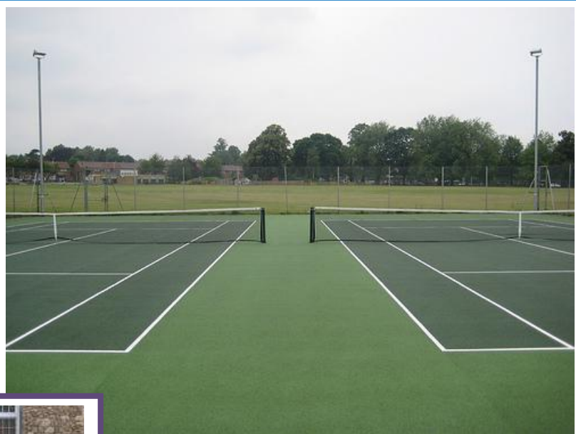
Tennis Courts (Side-by-Side)